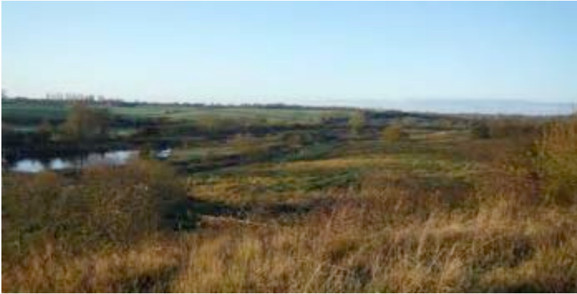
Kelham Bridge Nature

Please let me know by the end of this month (November) if you would be interested in